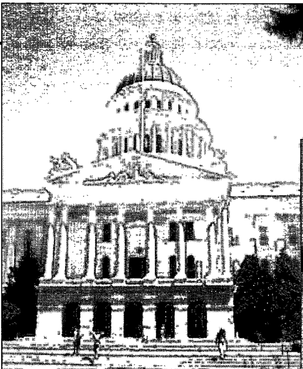
Capitol building in Sacramento, two blocks away from the convention center.